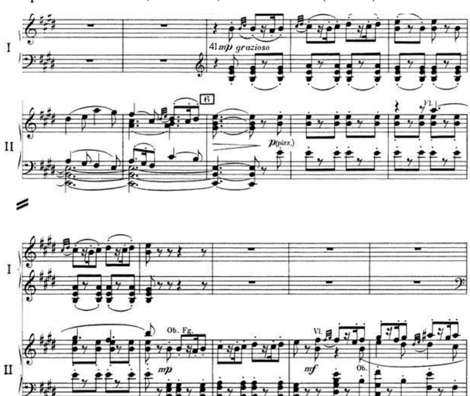
Example 5: Alfredo Casella, Scarlattiana, fourth movement (b. 41–45)